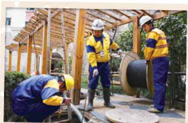
Provision of fibre network services in residential communities

All levels of the Group listened to the requests of employees and cared for the psychological well-being of our employees. The Company leveraged the “China Telecom Employees’ Honours System” to motivate employees to continue to pursue excellence. China Telecom continued to provide support for its employees who were in difficulty, regularly offering comfort to its employees and helping all employees to solve their practical difficulties and problems.